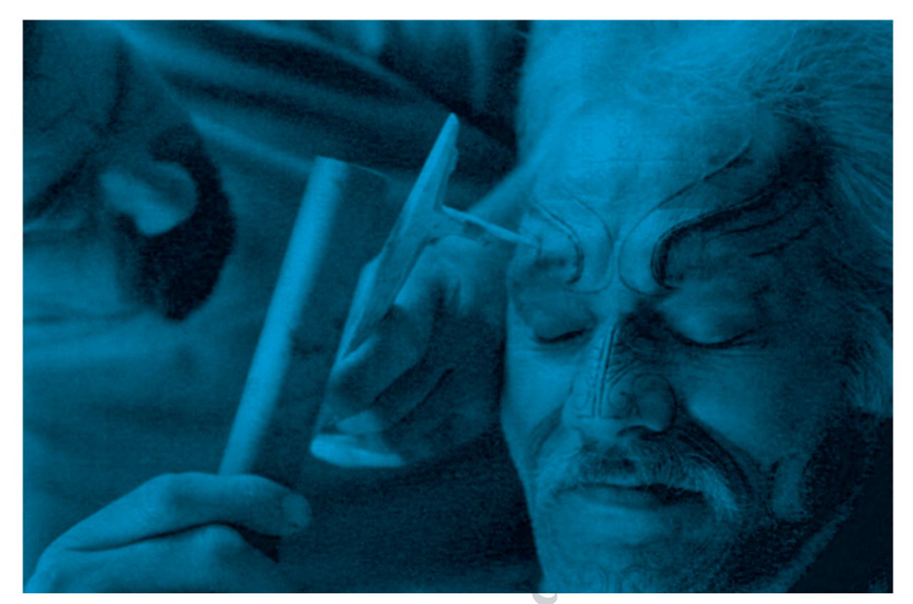
Pic. 4. Traditional tattoo making

was also connected with the transition phase. The tattoo ceremony was taboo.