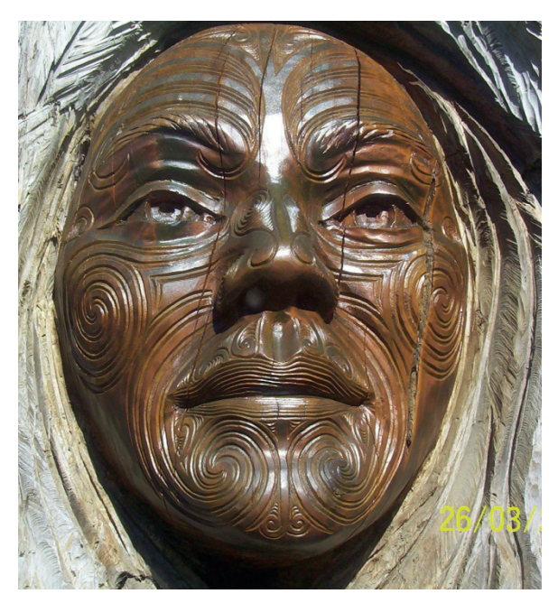
Pic. 5. Characteristic patterns (Sculpture in Abel Tasman, South Island)

currently, are instances of entities of the same kind existing in the past. This relation is the essence of inheritance for Maori. This means the relation between an ancestor and descendant. For Maori the whole universe is a gigantic family originating from the same ancestor.