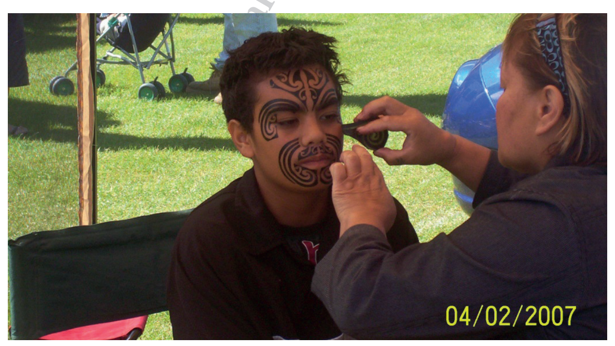
Pic. 6. Youth cultivating the Moko tradition, temporary facial painting