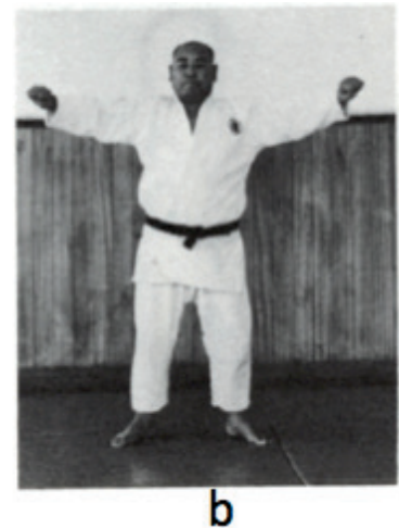
Figure 3. Forms of Sayu-uchi in SKT