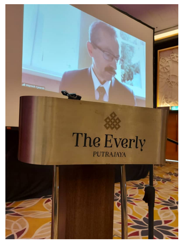
Photo 8. The President of IMACSSS appeared in Putrajaya only on the screen, on a remote connection.

Due to the direct absence, it was not possible to present the Gold Medals of Honor to people of particular merit for the IMACSSS, and which were agreed at the Viseu conference. Probably it will take place at the earliest opportunity [photo 8]. It has already been agreed that the next IMACSSS conference will be held in Chongqing (China) 2021, and at the meeting on October 10, 2020 in Putrajaya was decided that in 2022 it will take place again in Rzeszow (Poland).