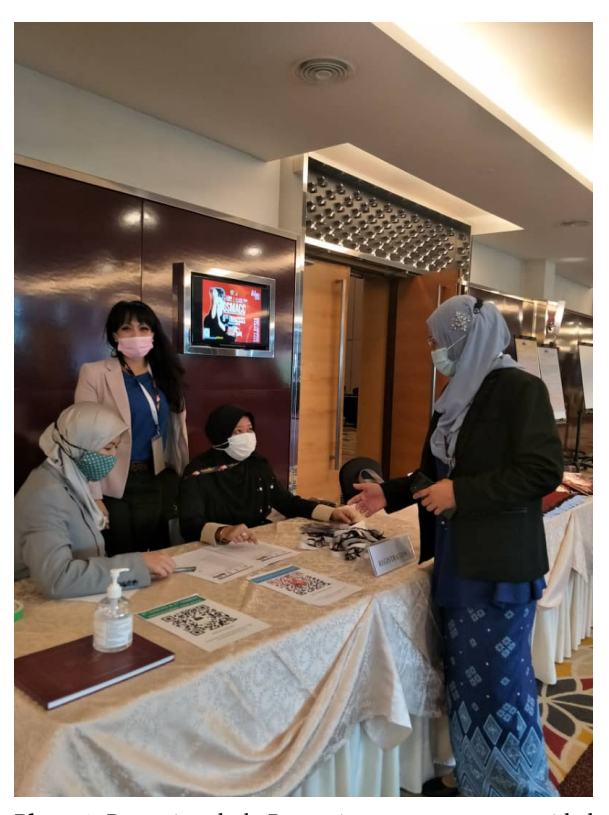
Photo 1. Reception desk. Protective measures are provided according to sanitary rules.

bought approximately 46 square kilometers from the state of Selangor on which Putrajaya was built. It is now a beautiful city with the Putra Mosque (Malay – Prince), with modern stylized architecture. Remote participation forced an online tour of the city.