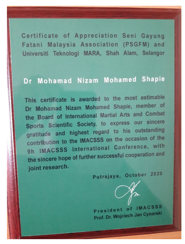
Photo 7. Certificate of Appreciation for the organizer of the conference in Putrajaya, funded by IMACSSS.

event (risk of infection, air traffic disruptions, required quarantine, etc.).