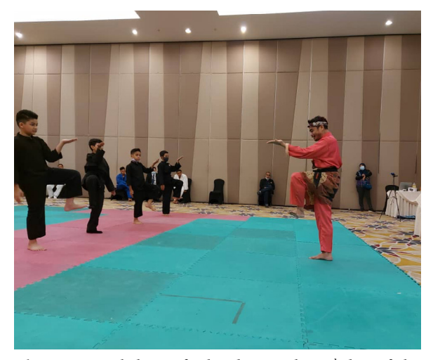
Photo 6. Workshop of Silat during the 3<sup>rd</sup> day of the conference.

The scientific level of the content presented was at least good. organizationally, we can speak of a success, despite the attendance being much lower than originally expected (for obvious reasons). From among the submitted applications, a total of 50 works were accepted, the abstracts of which were published in the Abstract Book [Shapie et al. 2020]. The pandemic situation, canceled flights, and the necessity of a two-week quarantine resulted in many teams from Europe (who had previously applied for participation) canceling their participation. So the participants from Malaysia dominated. The organizers also had to face the challenge of communicating with participants from different parts of the world and time zones (Europe, Brazil) by adjusting the time of "virtual" sessions.